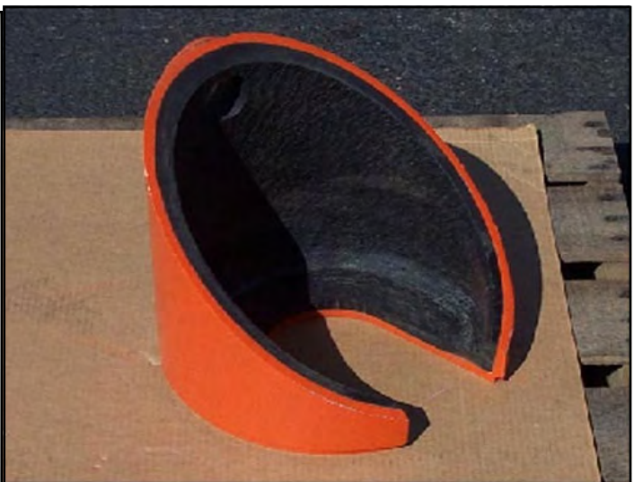
LH95-1 BELL LIFTER