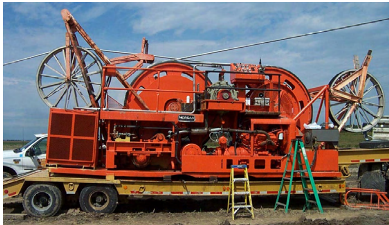
LH41-96-1 (96" dia bullwheels, single) River Crossing Tensioner