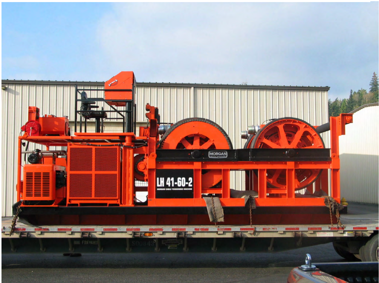
LH41-60-2 (60" dia bullwheels, 2-bundle)