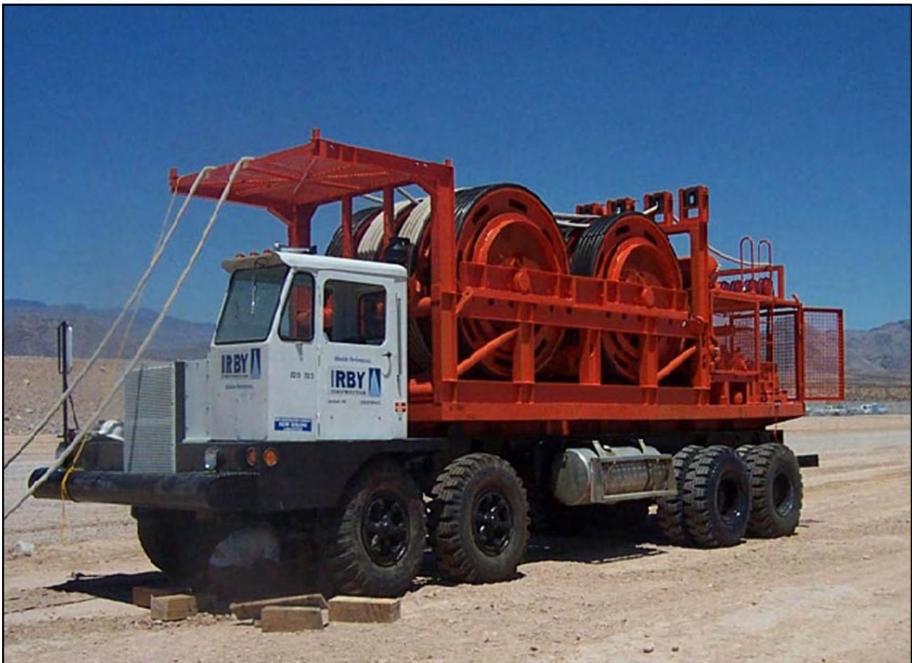
LH41-75-4 (75" dia bullwheels, 4-bundle)