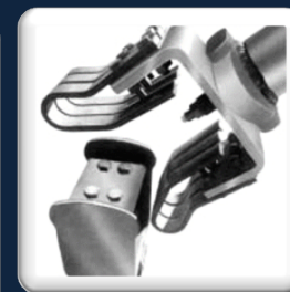
2000A Jaw – Partially Open