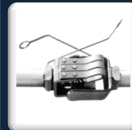
2000A Jaw – Closed Position