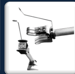
1200A Jaw – Partially Open