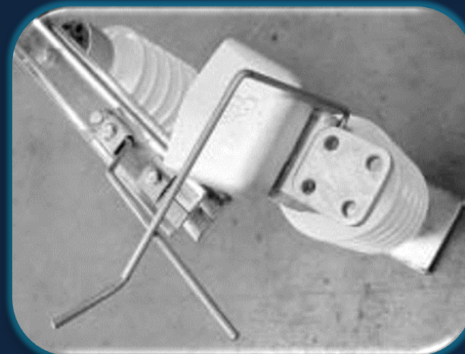
R14C with optional arcing horns