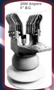
2000 Ampere, 5" B.C.