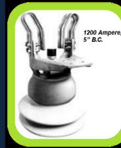
1200 Ampere, 5" B.C.