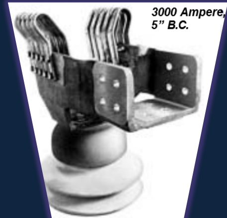
3000 Ampere, 5" B.C.