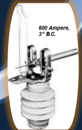
600 Ampere, 3" B.C.